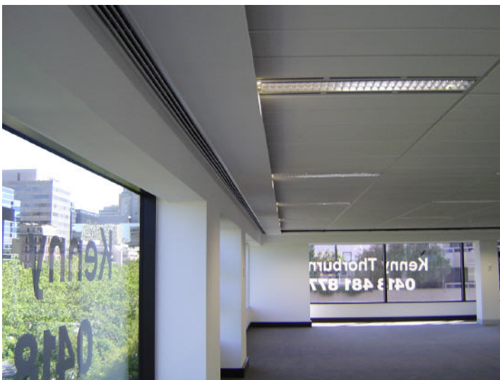
Continuous Linear Perimeter Grille and Ceiling Mounted Terminal Units