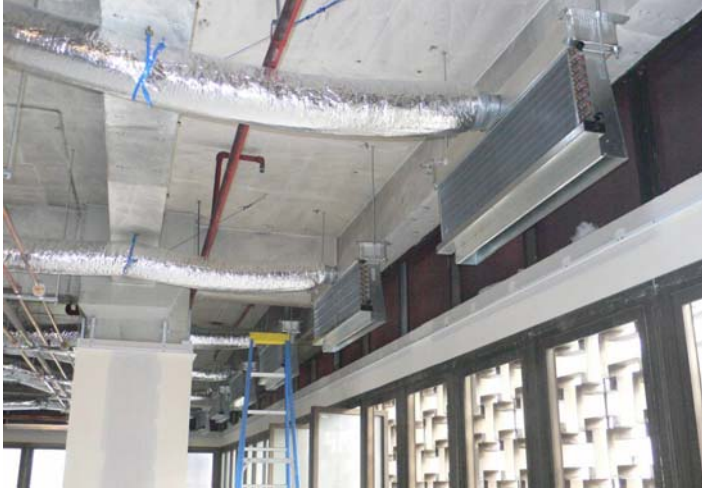
CM10 Ceiling Mounted Units During Installation