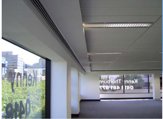
CM10 Ceiling Mounted Units with Continuous Air Grille

Eurovent Certified Product to Rating Standard EN15116